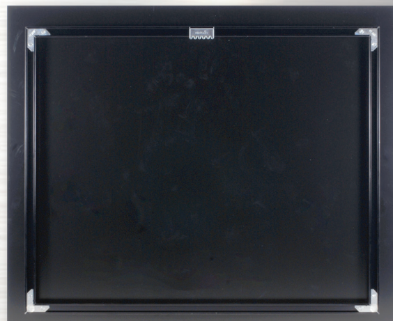
Elegant Black Back Finish and Black Aluminum Metal Frame

Standard presentation includes an inset black 3/4" aluminum back frame but other options are available. (easels, flat plate, standoffs, floater frame, float block).